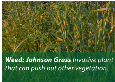
Weed: Johnson Grass Invasive plant that can push out other vegetation.