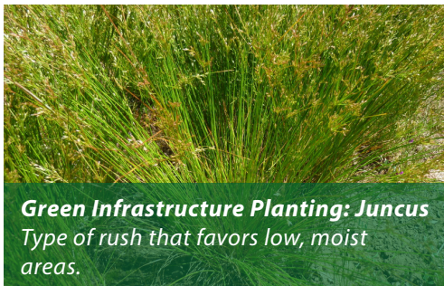
Green Infrastructure Planting: Juncus Type of rush that favors low, moist areas.

Plants play a key role in green infrastructure, so it’s important to know which ones belong and which should be pulled.